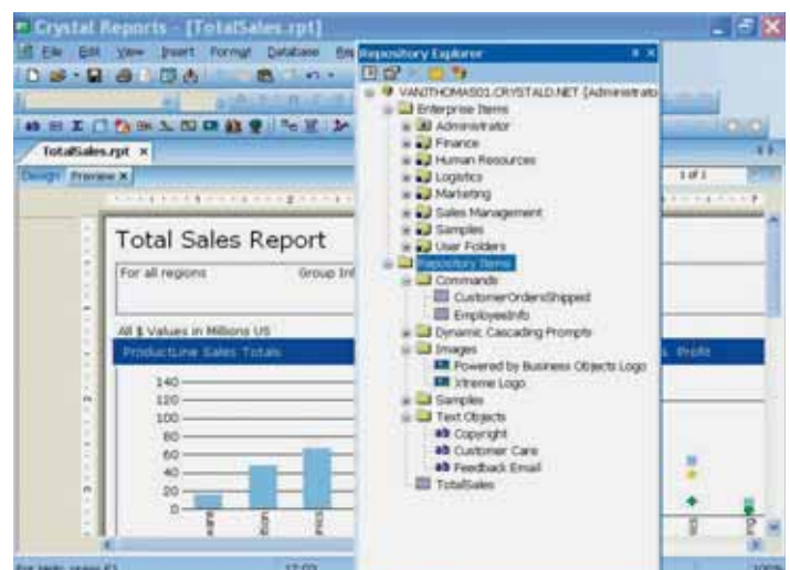
Figure 1: The Report Component Repository

With SAP Business One and Crystal Reports Server, you can access critical business information any way you require it and at any time, even from your familiar Microsoft Office applications and Microsoft Office SharePoint Server. Crystal Reports Server provides flexible and unconstrained control over database connectivity. With it, you can directly access relational, XML, online analytical processing (OLAP), and